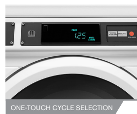
ONE-TOUCH CYCLE SELECTION