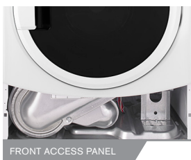
FRONT ACCESS PANEL