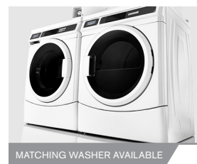
MATCHING WASHER AVAILABLE