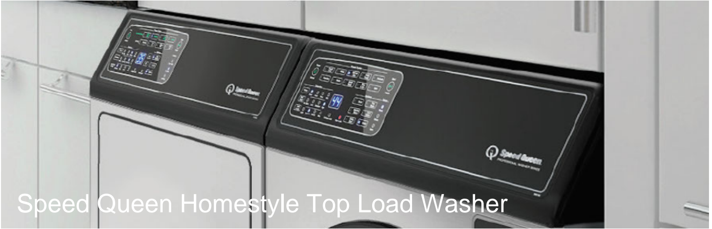
Speed Queen Homestyle Top Load Washer